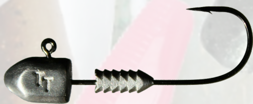
FINE WIRE (HEADLOCKZ FINESSE)

When selecting a jighead this information is often printed on the packaging, for example 1/0L ('L' refers to light wire), 1/0H ('H' refers to heavy wire) and 1/0XH ('XH' refers to extra heavy wire).