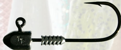
HEAVY WIRE (HEADLOCKZ HD)